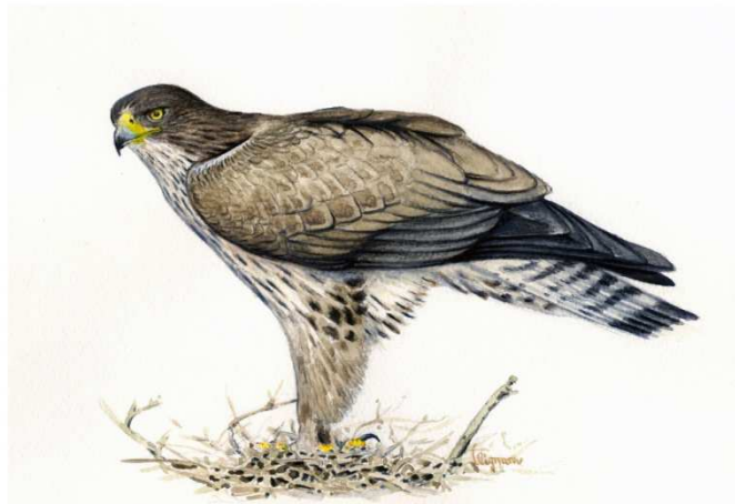
Bonelli's Eagle (drawing)