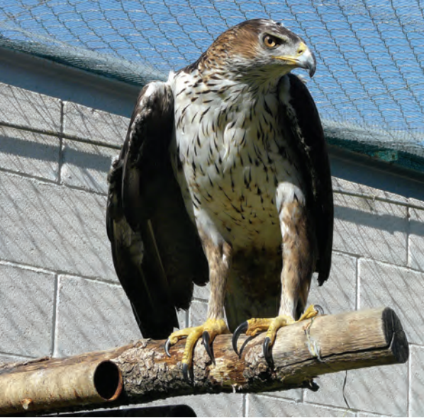
A Bonelli's eagle at the GREFA facility.