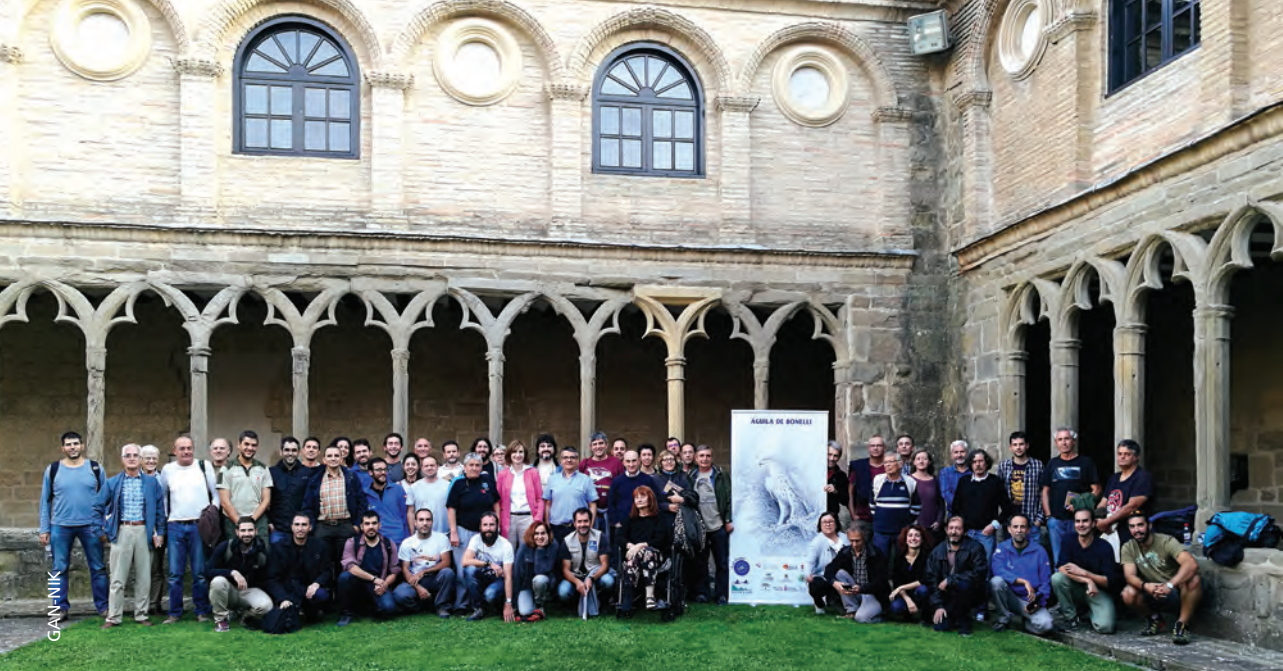
Experts from Italy, Israel, France and the Iberian Peninsula take part in the International Seminar held in Navarre at the end of the project.