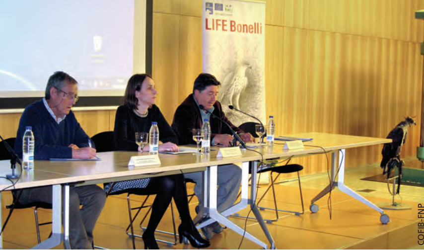
Day of the Eagle 2015: Conference by Miguel Delibes "Lynx, Eagles and creative conservation."