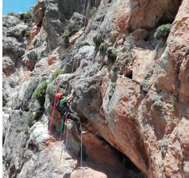
The work of the Andalusian Environmental Officers and particularly that of the Work at Height Unit has been essential to removing eaglets from nests.

Just over half the Bonelli's eagles released during the project (50 individuals) have come from three captive breeding centres associated with the LIFE project. Two of these centres are French, belonging to the Union Française des Centres de Sauvegarde de la Faune Sauvage/Ligue pour la Protection des Oiseaux (UFCS/LPO, French Union of Wildlife Preservation Centres/League for the Protection of Birds), and the third belongs to the Grupo de Rehabilitación de la Fauna Autóctona y su Hábitat (GREFA, Group for the Rehabilitation of Indigenous Wildlife and its Habitat), based in Majadahonda, Madrid. Between them, these three captive breeding centres have 12 breeding pairs of Bonelli's eagles and represent the main source of eaglets available for release.