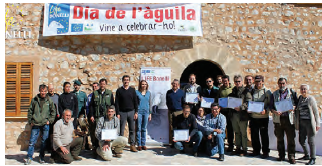
Day of the Eagle 2015: Award of diplomas to recognise the members of the support network.

GREFA in Madrid and COFIB and Fundación Natura Parc (FNP, Nature Park Foundation) in Mallorca have developed an environmental education programme called "Living Nature", which, through exhibitions, surveillance cameras and visits to various parts of the Centre, allows visitors to see how the species behaves and learn about the veterinary work carried out, the population reinforcement methods used, etc.