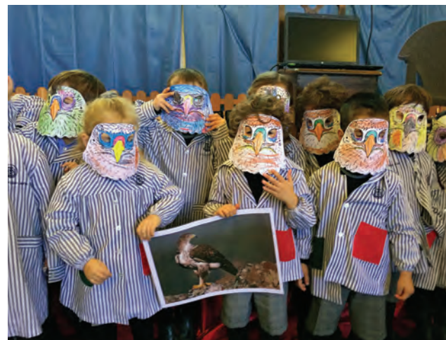
Environmental Education Workshop "Living Nature".